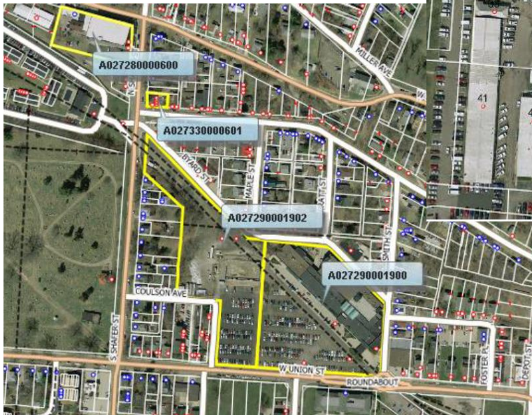
234 Washington St DRD

DRDs are economic development tools that promote the rehabilitation of historic buildings and encourage economic development and transportation improvements in commercial, mixed-use commercial, and residential areas.