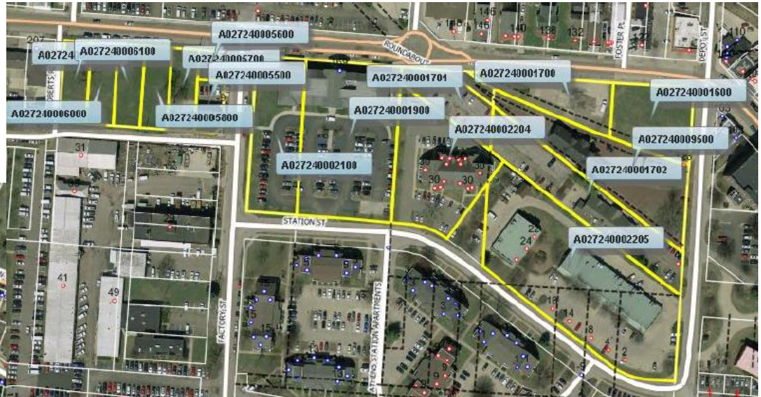
Depot Street DRD