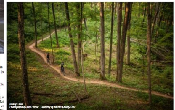
Baileys Trail

The county is also investing in infrastructure such as the large sewer expansion that will connect to the Athens Water/Sewer Department. Investments are even being made for supportive infrastructure along the Baileys Trail System. Powers reports, "Through a variety of partners, we have secured over $8 million in mainly public grants. Some of this funding will be used for infrastructure items such as the extension of a sewer line to a restroom, expansion of Hocking Adena Bikeway, creation of a new trailhead, and sidewalks. Those enhancements will be appropriate for the trail system we're developing here – the largest contiguous mountain bike optimized trail system east of the Mississippi River. It's also going to connect people to resources they don't