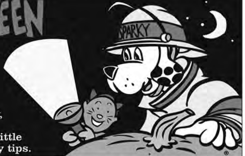
Sparky® is a trademark of the NFPA.

Halloween is a fun, and spooky, time of year for kids. Make trick-or-treating safe for your little monsters with a few easy safety tips.